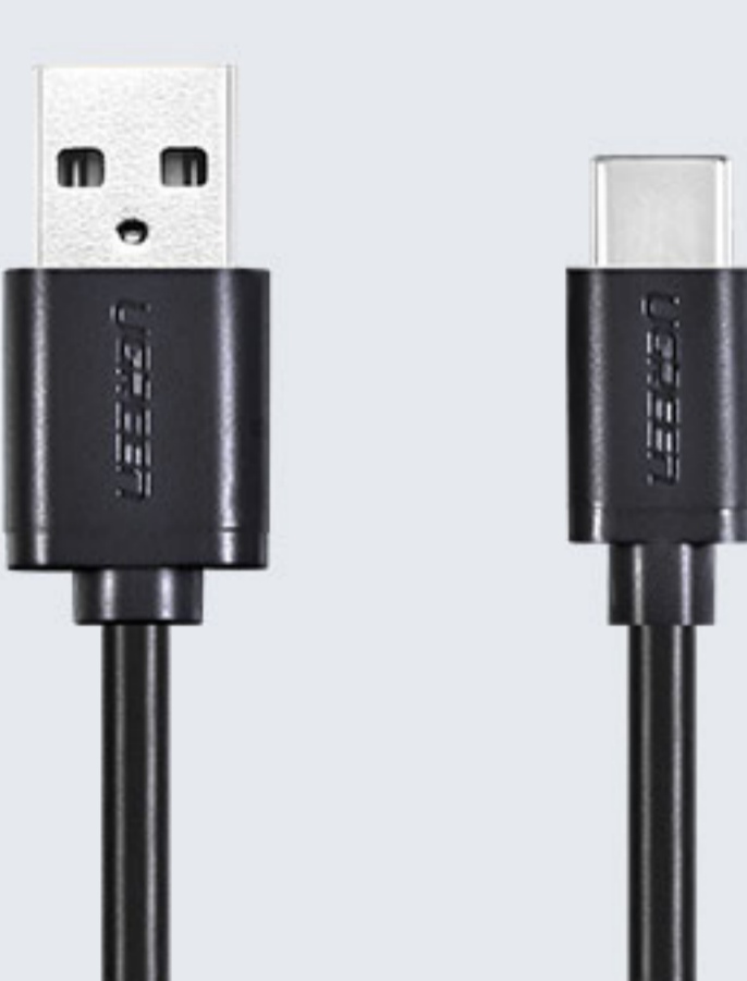
DC-BK-TypeC 1.0 meter Type-C cable