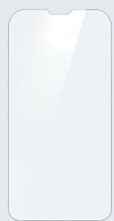
SP-C60 Tempered glass screen protector