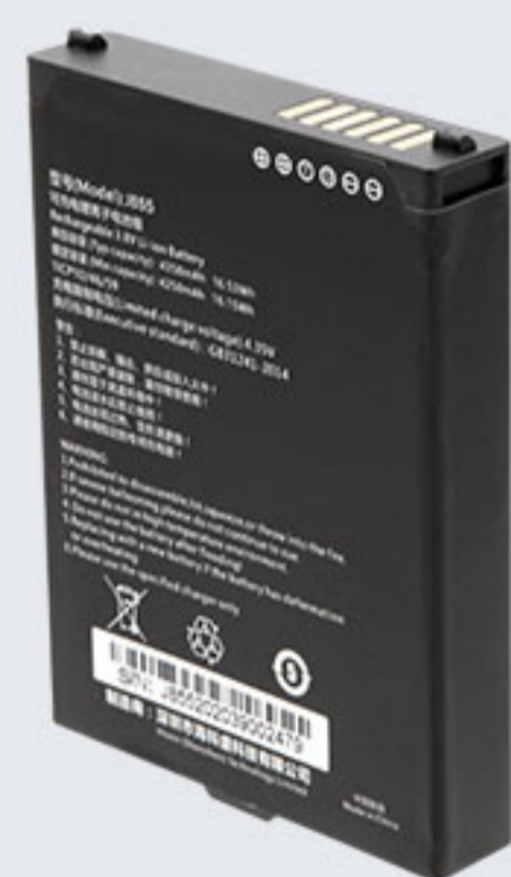
BTRY-C60-43MA 4350mAh Li-Ion battery, 3.8V output